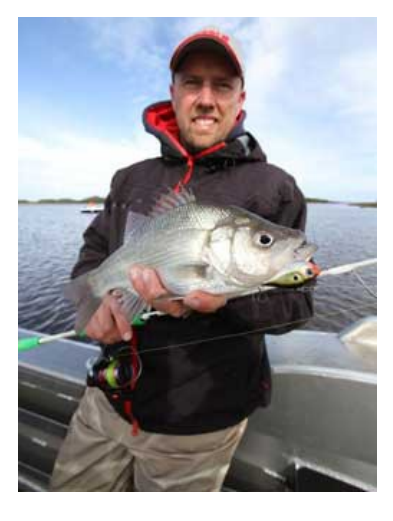
Photo of Estuary Perch caught by Volunteers Anglers during the Great Perch Search of the Glenelg River and the Hopkins River. These fish were used as breeding stock by Fisheries.

Last month six of the lakes were surveyed by Deakin University and preliminary results indicated that estuary perch from each stocking had survived and "good" to "excellent" growth rates had been achieved.