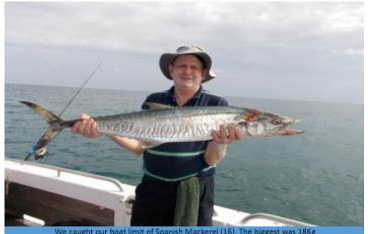
We caught our boat limit of Spanish Mackerel (16). The biggest was 18Kg