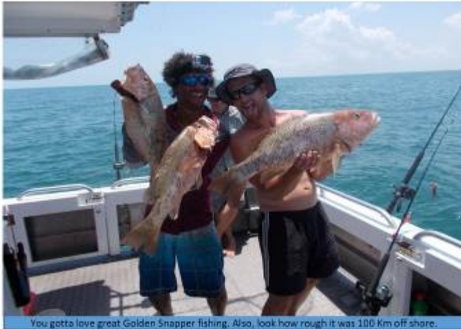
You gotta love great Golden Snapper fishing. Also, look how rough it was 100 Km off shore.