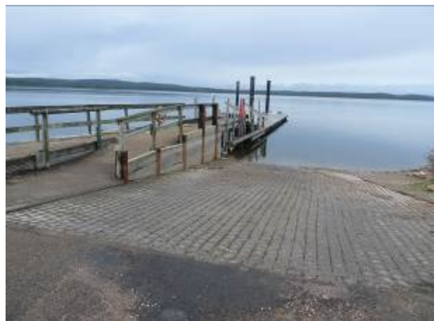
Photo. The Current Ramp at Luderick Point