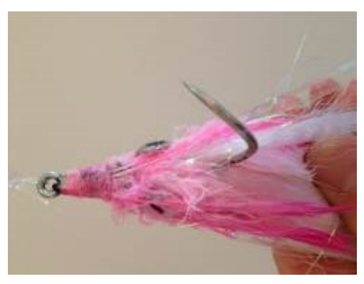
This is how the Klingon Fly started out and how it ended up with bent hook after its encounter with the sail fish