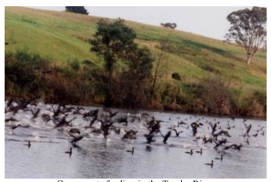
Cormorants feeding in the Tambo River

it is only in relatively recent years that the problem has been studied.