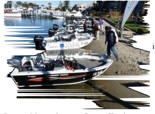
Boats at Metung in recent Bream Classic

and I am aware that one angler imported a Hewes Redfisher from America. He explained as well as all the other attributes of local craft this 16ft boat would float on 10 inches of water. His boat was powered by a 90hp Yamaha motor, and the boat would be used largely for fly fishing for black bream and estuary perch, which in itself is a developing form of fishing estuaries. In a national survey (2000-2001) $3.3billion was attributed to the ownership of recreational fishing boats in Australia, whilst Victorian recreational anglers had 86,000 vessels with an estimated value of $620 million.